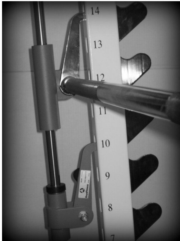
The hook locking mechanism (top) and the safety catch (bottom)

Regardless of the type of Smith Machine you have access to, the basic operation and safety features remain the same. The affixed barbell contains a built-in hook mechanism on each side of the bar. You lift the bar and twist it backward to unhook (unlock) it from the post or slot that currently holds it in place (some machines reverse this operation and have you twist the bar forward to unlock). This allows the bar to move freely along the rails. When you want to secure the barbell, you can twist the bar forward at any point in order to hook it into the nearest post or slot.